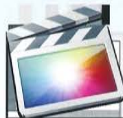
apple Final Cut