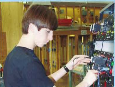
TABLE OF CONTENTS — Programs of Study